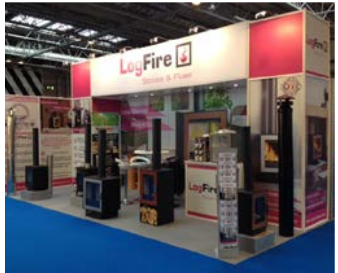
LogFire stand at the Homebuilding & Renovating Show 2015 at the NEC in Birmingham

Our LogFire division is continuing to take the stove and flue market by storm, and after a last minute offer, the team exhibited at the Home Building & Renovating Show at the NEC in Birmingham. The four day show hosts thousands of visitors each day and the exhibition had some promising results from building contractors, home owners and many more.