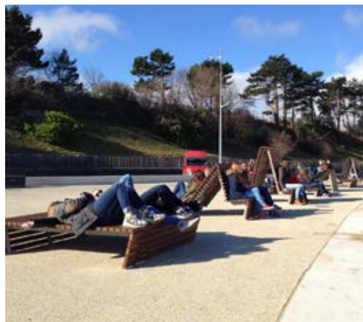
Sitting pretty: The new seats have caught the eye of visitors

The project was completed in just seven days after a lot of hard work and dedication from the team. Well done to all of those involved.