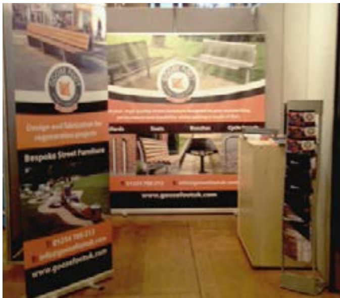
Goose Foot stand at Regen 2015 in Liverpool.

One of the latest projects from Goose Foot included 10 bespoke seats for Colwyn Bay in Wales, a contract that came in the back of our attendance to the previous Regen conference.