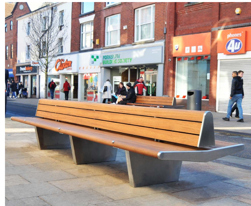
Central Gateway Project, Fishergate, Preston

We would also like to congratulate all those involved with the Fishergate regeneration project which was a great success and we are now adding the new benches to our range of street furniture.