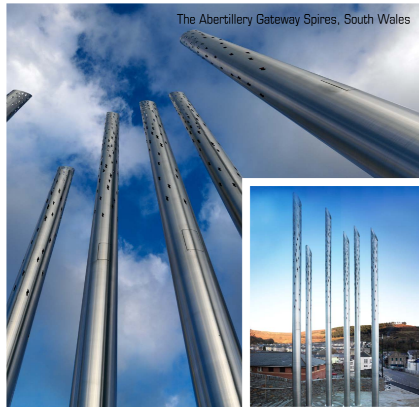
The Abertillery Gateway Spires, South Wales

A huge well done goes to the all the team who have been a part of this stunning piece of work, the project is a real accomplishment.