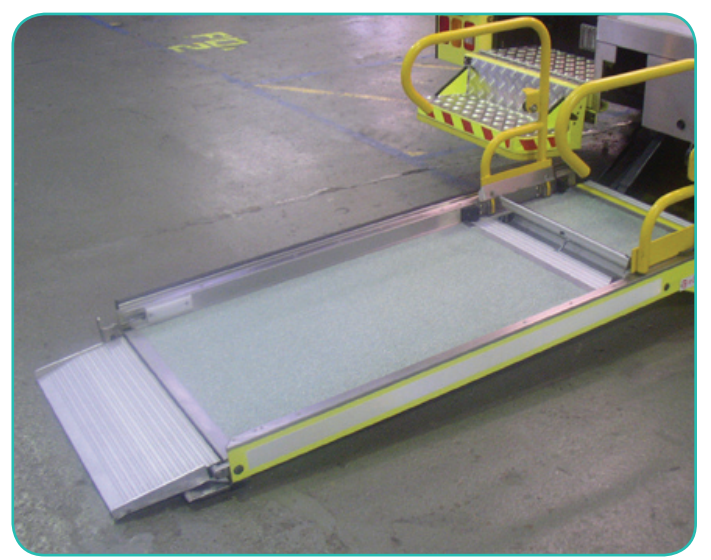
Deployed with the toe ramp down and ready to receive a stretcher or carry chair.