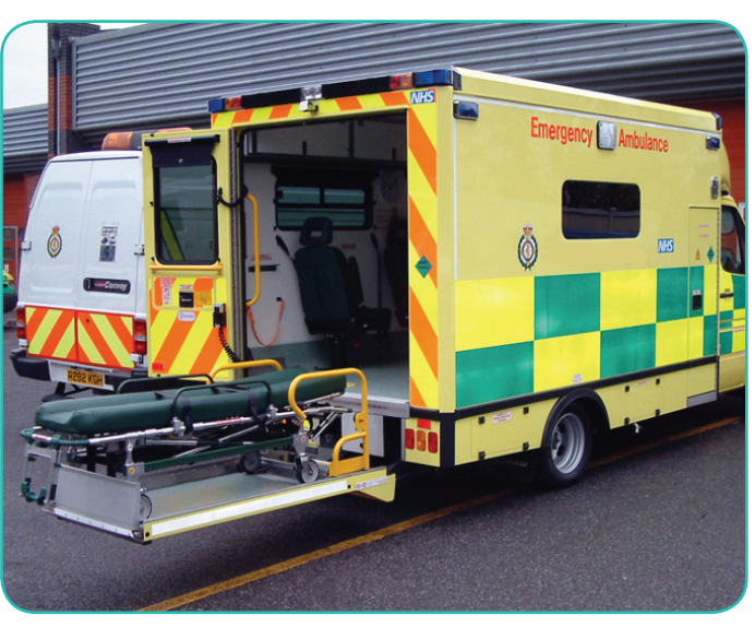
Lift being deployed showing the toe flap and the trolley stop in the 'up' position and safety handrails.