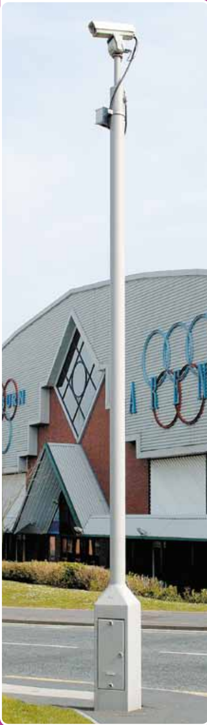
TC & CB Range

The TC and CB range of CCTV columns remain the specifiers number one choice for cabinet based columns, for use within city centre and urban schemes. The 400 square cabinet remains the mainstay of this range of columns, with cabinet options of 325 and 500 square readily available for terminating all communication and electrical needs. The proven design, along with many versatile features, keep it at the forefront of CCTV street furniture and it is still the industry standard.