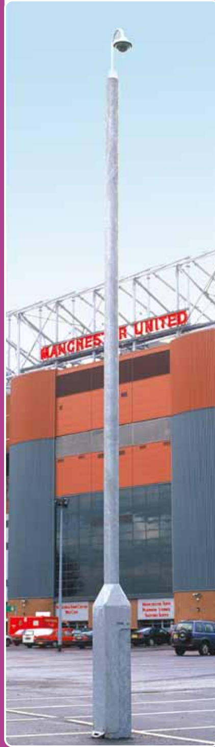
TCTO & CBTO Range

The TC and CB range naturally evolved into the TCTO and CBTO range of tilt-over columns, for use within city centre and urban schemes. The added bonus of maintenance at ground level make this a popular and safe first choice where access for maintenance is of concern. The 400 square cabinet remains the mainstay of this range, with the 325 cabinet option readily available. The sturdy, proven design, along with many versatile features, keep it at the forefront of CCTV urban furniture with the added bonus of tiltability.